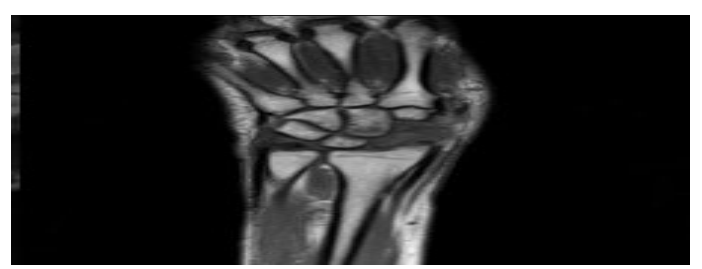
Figure 2 - MRI of wrist showed resorption of proximal three fourths of scaphoid with softtissue involvements.